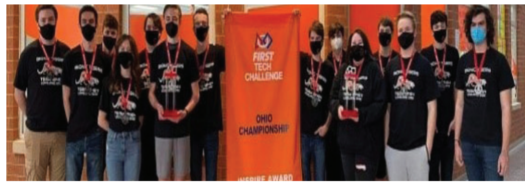
Inspire Winner & Top Ranked Team - 10464 The Bionic Tigers from Loveland, Ohio

You can watch the Ohio FIRST Tech Challenge State Championship Awards and Closing Ceremony on YouTube at: https://youtu.be/7SxnZwJSnaA